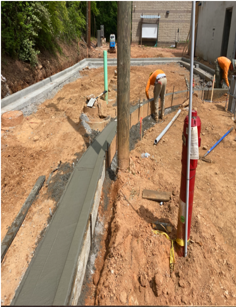
Begin curb and gutter construction for the dumpster pad