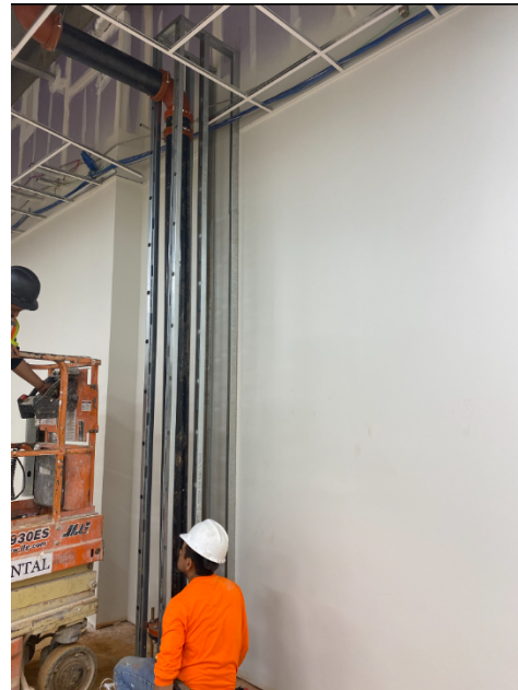
Begin metal stud framing for fire riser in the flex room